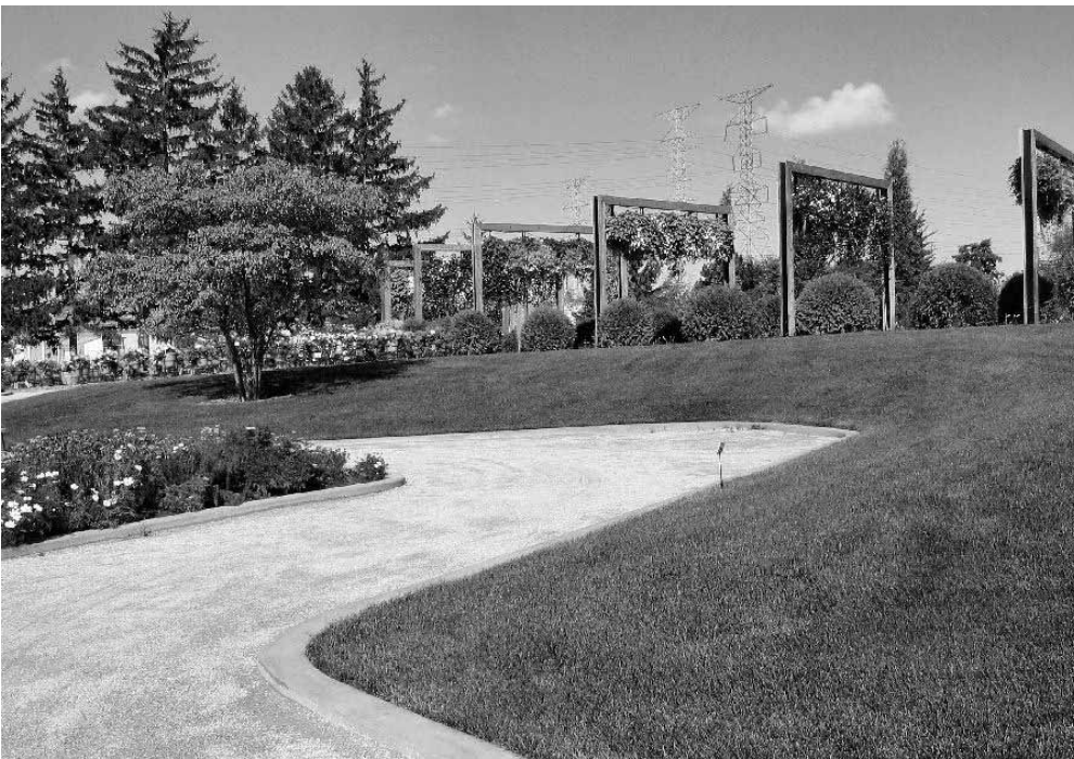
Ball Seed Gardens

Call Sam Childress (630 231-1971) or Lou Horton (630 293-7735) to offer your services or to suggest a garden or porch to be included on the Walk.