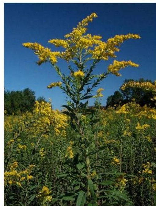
Solidago canadensis .

Should we avoid aggressive native plants in our gardens? I think there are a couple of ways that we can live peacefully with more eager native plants. One is to plant eager native plants with other native plants that are more eager and avoid planting them near more delicate plants or ones that don’t reseed and spread easily. Plant the less eagere native plants in another area. The eager plant area could yield delightful results if you want to fill in the area quickly to outcompete actual weeds and invasives. And hopefully you allow them some room to spread. I am seeing more and more about how having larger numbers of one plants species helps birds and pollinators manage their energy by giving them a lot of “bang for their buck” like going to the mall instead of making stops at 5 different stores that are each a half mile or more away from each other which obviously takes more energy. I think we have all have seen how Goldenrod is beloved by pollinators. The Plant Fact Sheet from the USDA states: “Solidago species provide vital sources of pollen and nectar for bees and other insects in the late summer and fall throughout North America.”