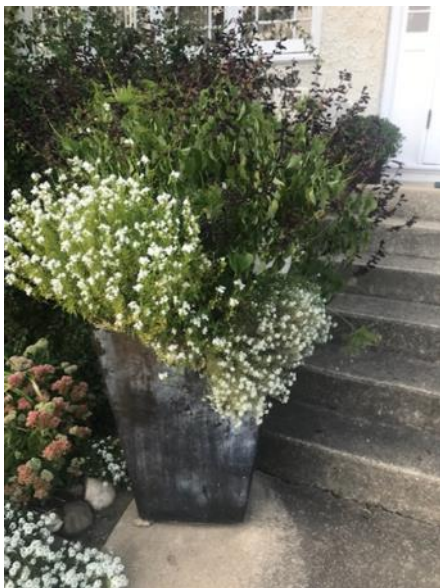
White alyssum overflows in abundance from this contemporary-styled urn by the front steps of the house.

So, the next time you are at Kruse, stop and look at—and even sniff—the planted containers.