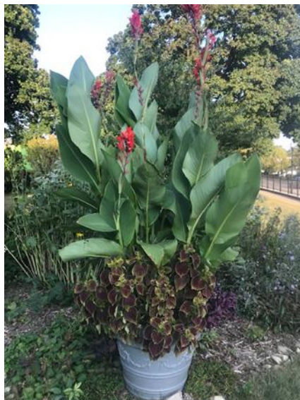
In the most spectacular urn of all that anchors the front street-facing bed, a canna flames over brightly colored coleus.