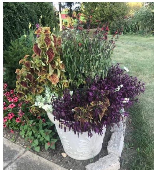
Though beginning to fade with the onset of fall, the riot of colors created by the combination of coleus, annual salvia, and inch plant in this pot in the small front bed is still much apparent.

We welcome you to visit Kruse House Gardens and if you are interested in working in the gardens we are there Wednesdays, 9:00 to 11:30am.