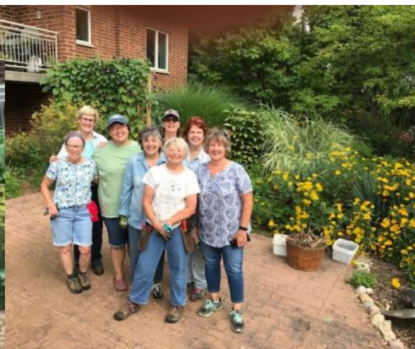
Mulch Workday Volunteers!