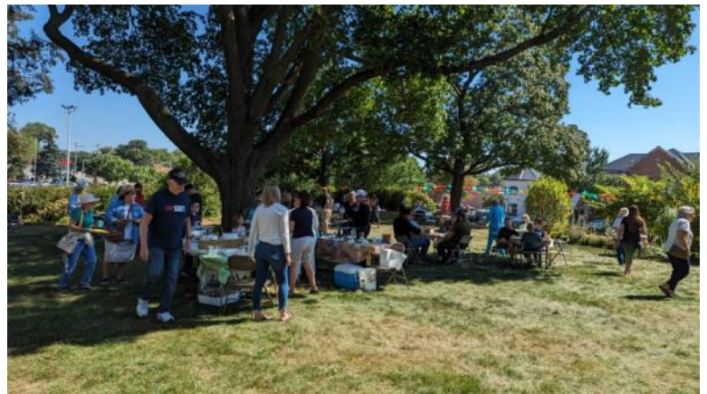
Ice Cream Social—2023