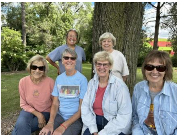
Kruse Gardeners—September 6th

“Try to remember a kind of September when life was slow and oh so mellow.”