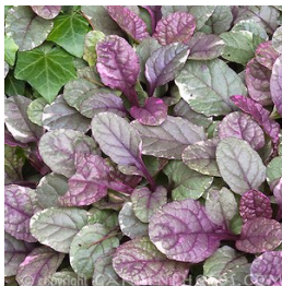
Ajuga reptans 'Burgundy Glow'

Spotted Dead Nettle (Latin name: Lamium maculatum ) is well suited to a variety of growing conditions. It's drought tolerant and also deer and rabbit resistant. Foliage can vary from the silver-marbled, green-edged leaves of 'Shell Pink' to the bright golden leaves with a silver center of 'Aureum'. Lamium provides a bright silvery touch to a shade location. "'Pink Pewter' is looking particularly nice at the moment. The extra amount of silver on the foliage, when compared to 'Shell Pink', really shines in the shade," says Kyle Lambert, Perennials Manager.