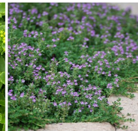
Thymus praecox 'Coccineus' Red Creeping Thyme

Red Creeping Thyme is such a fragrant, tough and versatile groundcover. It quickly forms a thick green mat and has an abundance of magenta flowers in summer. Plant Red Creeping Thyme in between stepping stones or along a path where its fragrance can be released when walked upon. Thyme likes well-drained soil and is drought tolerant. It is perfect for a living mulch under roses.