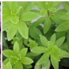
Galium odoratum Sweet Woodruff