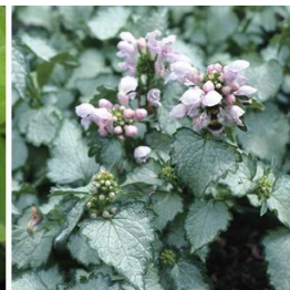
Lamium maculatum 'Pink Pewter'