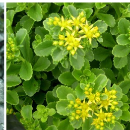
Sedum kamtschaticus Stonecrop