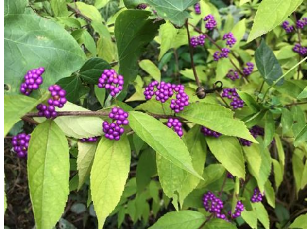
Beauty Berry Bush - Jan's donation last fall