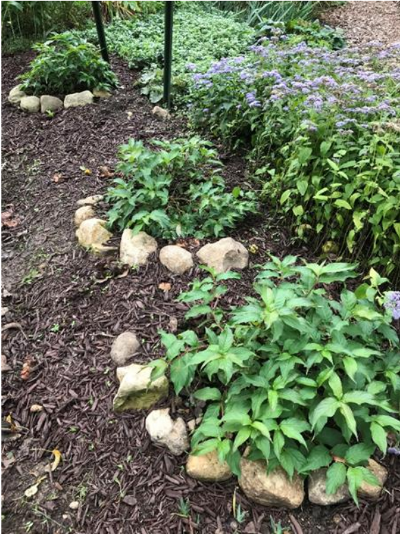
New Plantings - Dwarf Bush Honeysuckle