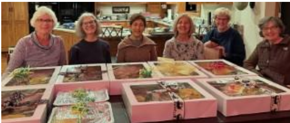
The Cookie Caravan was a huge success!