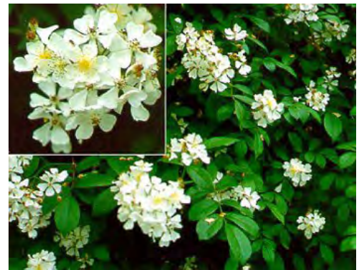
Multiflora rose ( Rosa multiflora ) - #1 Illinois 2011 invasive species according to the Center for Invasive Species and Ecosystem Health.