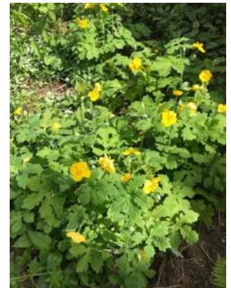
Two Natives: Celandine Poppy & Golden Ragwort