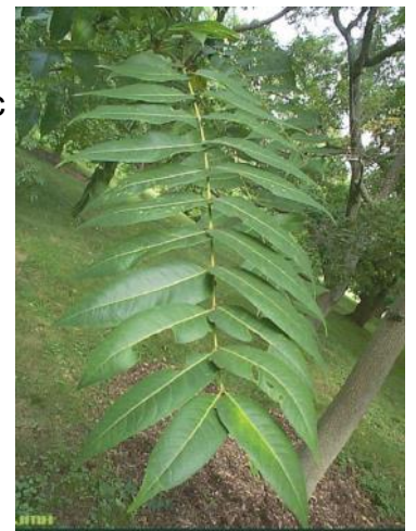
Tree of Heaven

Check out the Morton Arboretum website: https://mortonarb.org/ Join the fight against invasive species.