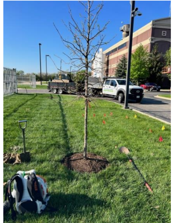
One of three Swamp White Oaks donated by the Garden Club to the City of West Chicago.