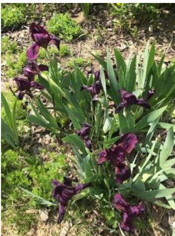
Iris in bloom in the front East bed.

If you are interested in volunteering, our Kruse Gardeners are out in the garden (527 Main Street) every Wednesday morning (weather permitting). All are welcome!