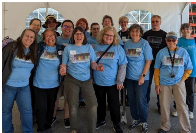
The "Clean up crew" around 3pm

We are in need of 1 gallon pots that are free of trademarked labels. We could also use the trays to hold them. We can use 4 inch pots and 6 inch pots , preferably with trays. We don't need the 4-pack/6-pack/8-pack type pots as they are too small for perennials, difficult to reuse during our potting parties and we already have a large supply. We also have a fairly large supply of 2 and 3 gallon or more pots for shrubs. If you donate pots you will earn garden bucks to be used at our garden club auction at our November meeting. If you stay and help us organize the pots, you will also earn garden bucks. Thank you in advance and see you at the barn!