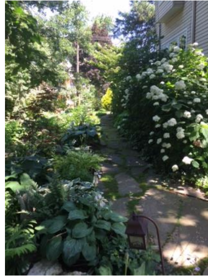
June & Mark's Garden