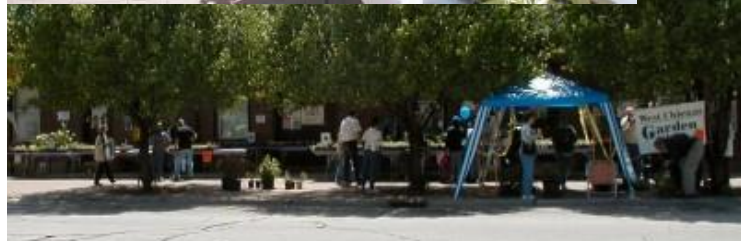
Plant Sale 2004 in front of the Fox Community Center

Plants from member gardens have always been the cornerstone of our sale. In the early days, members divided and potted up plants on their own and tended to them until the sale. For a number of years, there was a digging squad that went to members yards (at their request, of course) and dug and divided plants for them. Potting parties were held at member households to pot up plugs donated from Cantigny and evolved into opportunities for members to bring in their own to pot (and then take home to nurture until the sale) or help pot up plants acquired by the digging squad.