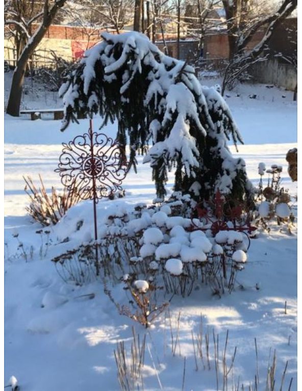
February at Kruse

In the meantime, we can all revel in good food, warm fires and the pleasure of the crisp winter air and dream about the coming spring.