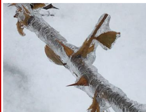
Kerry Perry's garden after the ice storm.