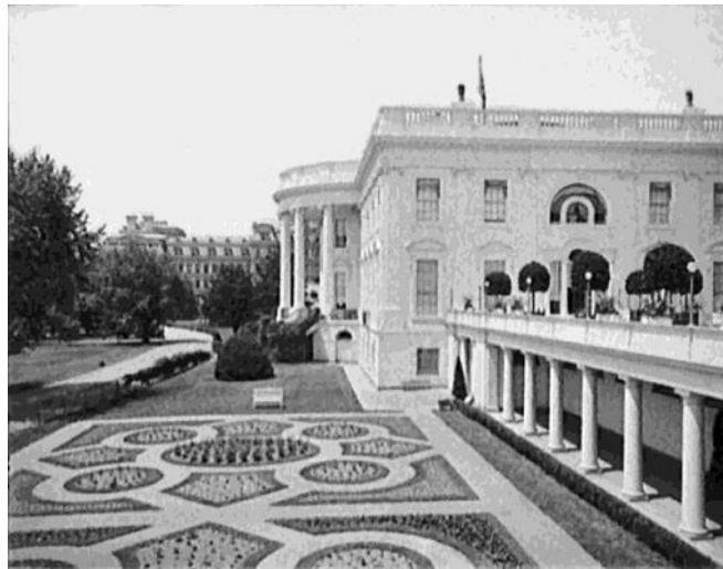
White House circa 1904

Between this month's presidential birthday boys, it seems that George Washington, first in war, first in peace, and first in the hearts of his countrymen, might also be first in presidential gardening. Although he never gardened at the White House (it wasn't finished until after his death), Mt. Vernon was celebrated in his times for its plantings. In particular, there were so many rose bushes that it took twelve days to harvest the petals which Martha made into rosewater.