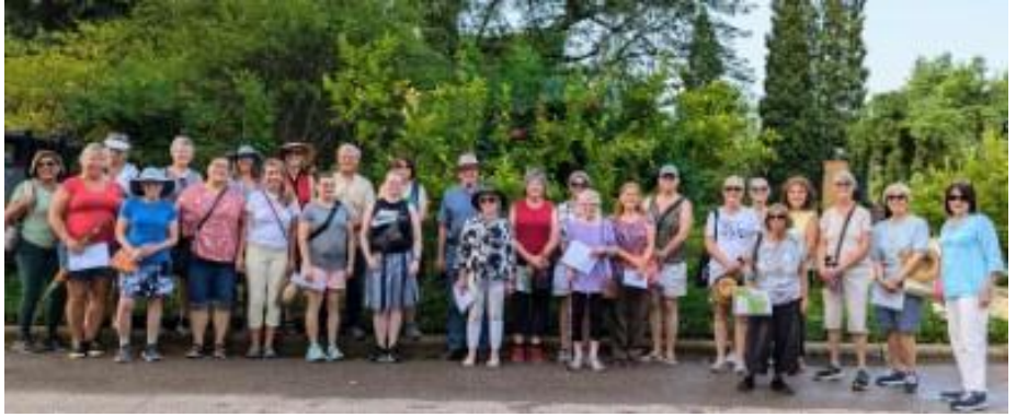
Members visiting the Garden at Ball Horticulture.