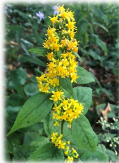
Zigzag Goldenrod ( Solidago flexicaulis ) {picture from Wisconsin Wildflower } This is one that I'd love to add to my shady garden.