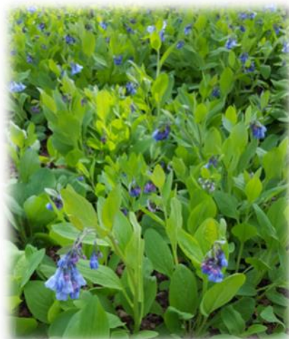
Virginia Bluebell ( Mertensia virginica ) from my very shady front yard—blooming before my maple leaves out

I hope this was helpful! Happy (native) gardening!