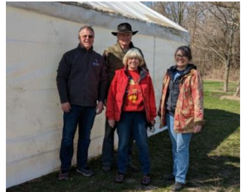
Tent Set up