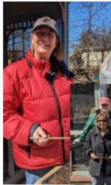
Pop-up Potting Parties