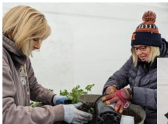
Perennial Potting Party #1