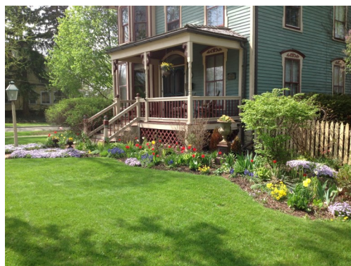
Pictured at right: Keith Letsche's front garden