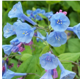
Virginia Bluebells ( Mertensia virginica )