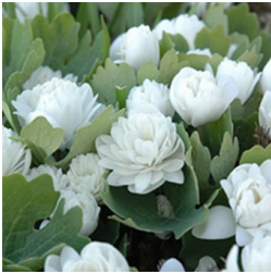
Bloodroot ( Sanguinaria canadensis )

Nothing seems to say “springtime is truly here” as the sight of our native woodland wildflowers in full bloom. With a few exceptions, most of these elusive spring beauties are tied into the seasonal rhythms of their shady woodland homes. Early spring provides a short window when these alluring plants can be enjoyed, even if it is for what seems to be a brief minute. When the warmer temperatures arrive, most species will go dormant for the season. They bloom for just a few weeks, and then their leaves turn yellow and the plants disappear. These plants are called spring ephemerals.